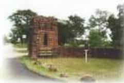
Bastrop State Park