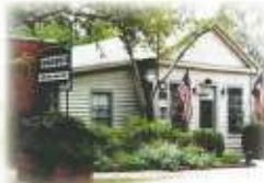
Bastrop County Historical Society Museum