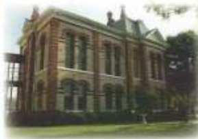
Bastrop County Historic Jail

See an authentic small Texas town in the heart of the Lost Pines.