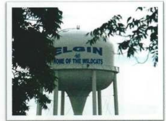
Identification of city as seen on US Hwy 290