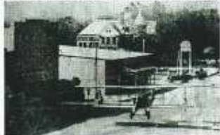
Scene from the "Great Waldo Pepper"

Elgin is becoming known in the "movie set" industry because of its pristine historic preserved downtown section which appears to be in the 1920s or 30s. Many movies and advertisements have been filmed in the town since the 1970s.